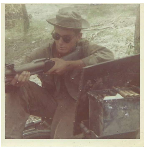
VN Me M79.jpg | Me playing with the M79. (700x700)