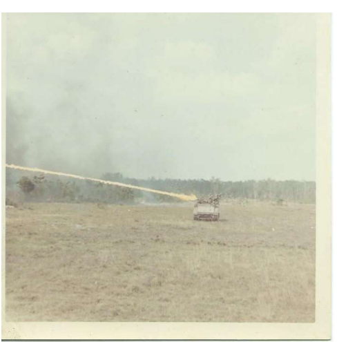
VN Flamethrower trac.jpg | Not sure where we were when I took this Pic, wouldn't want to be on the receiving end. (700x700)