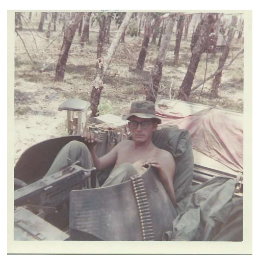
VN Me riding 50Cal.jpg | Me riding the 50 Cal (700x700)