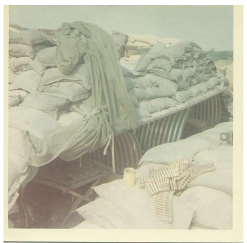
VN Hardspot Bedroom Suite.jpg | Do you remember these Bedroom suites? (700x700)