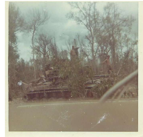
VN Tanks I remember working with them for a while.jpg | I remember working with some tanks at sometime, seemed like for about a month. (700x700)