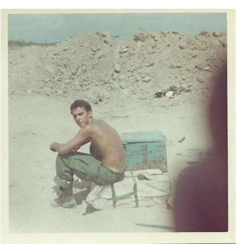
VN ME at the FSBWoods.jpg | Me at FSB Woods (Not sure which one). (700x700)