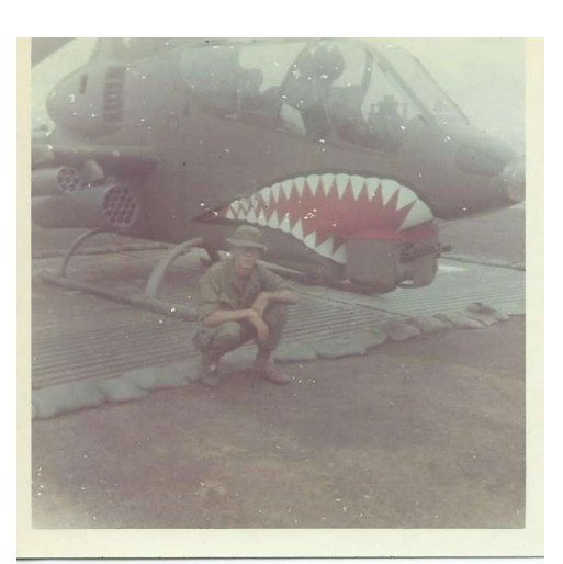
VN Now there's a bad M-Fer and the Cobra is pretty tough too Ha Ha.jpg | Now there's a bad M-Fer and a Cobra Ha Ha couldn't resist that one. We loved to see them flying overhead. Although I did have 2 bad experiences with them. (700x700)