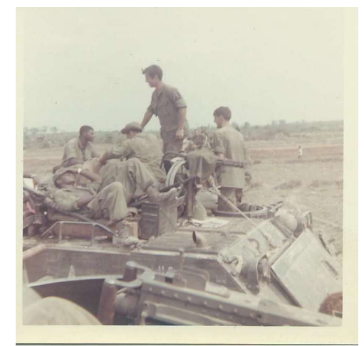
VN Minigun Trac.jpg | One of the Tracs in our Company had a minigun mounted instead of a 50. (700x700)