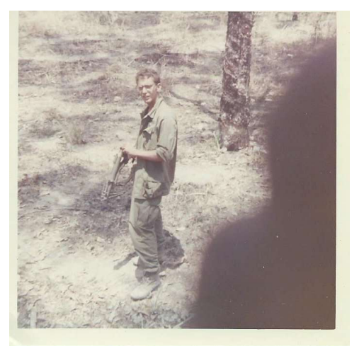
VN Me loading M79.jpg | Me playing with the M79. (700x700)