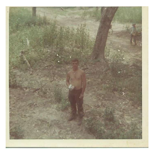
VN Dont know who this is.jpg | Not sure who this is, someone in our Platoon. (700x700)