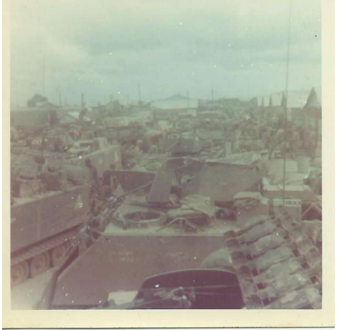
VN Dau Tieng Standdown.jpg | One of our Standdowns, they were a welcome break. (700x700)