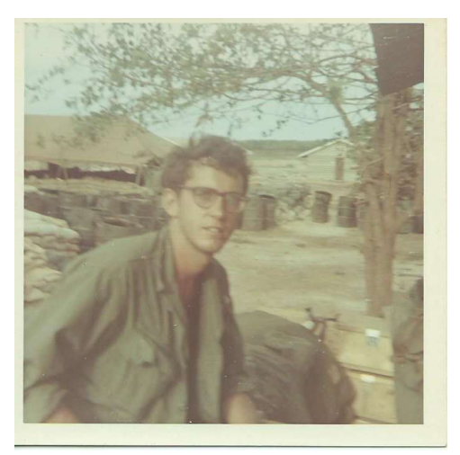
VN Me again.jpg | Anotherpic of me again at a firebase. (700x700)

VN ME 90MM (weapons squad carried one).jpg | 1-4 was the weapons squad so we had a 90MM Recoiless, never used in battle. (700x700)