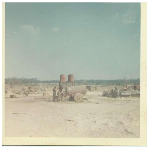
VN Hardspot Shower.jpg | Hardspot shower, nothing like showering out in the open. (700x700)