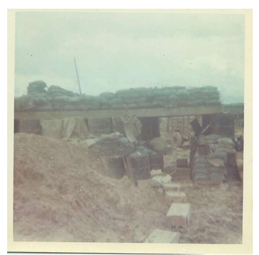
VN Bunker Monsoon.jpg | Remember how muddy it would get during monsoon? (700x700)