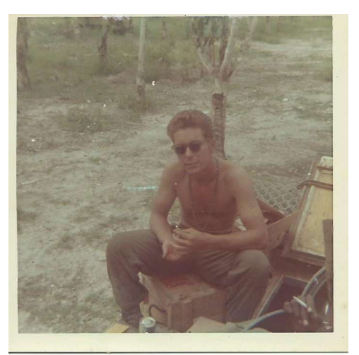
VN Medic from OHIO can't remember name.jpg | Medic from Ohio, can't remember his name. (700x700)