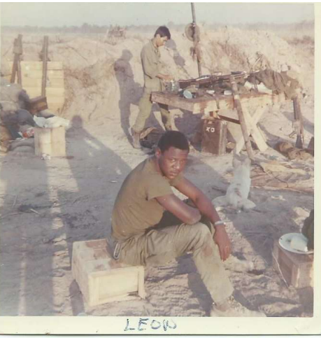
VN Leon Beanie.jpg | Leon, our 50 Gunner our dog to the right and Beanie in the back ground. (700x700)