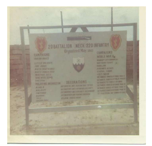
VN 25th Infantry Sign.jpg | 25th Infantry Sign, not sure where this was. (700x700)