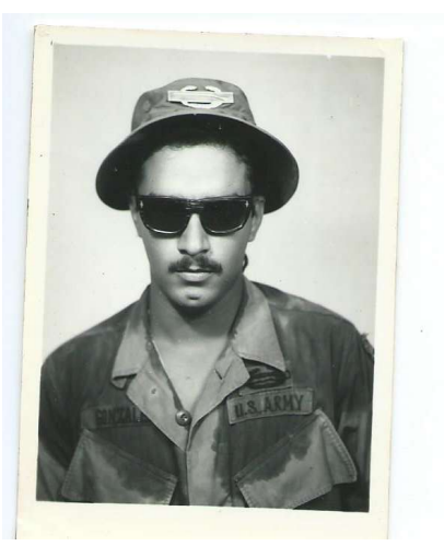
VN Speedy Gonzalez.jpg | We called him Speedy Gonzalez, not sure which squad he was in. (700x700)