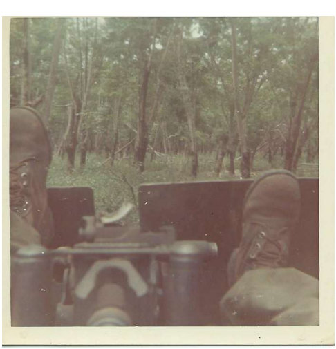
VN MeRiding the 50 and the RubberTrees.jpg | Me cruising through the rubber trees riding the 50. (700x700)