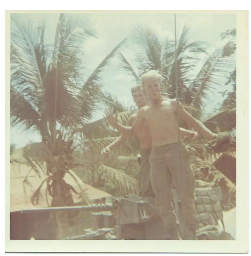
VN Don't know names.jpg | Another Trac from our Platoon but don't know there names. (700x700)