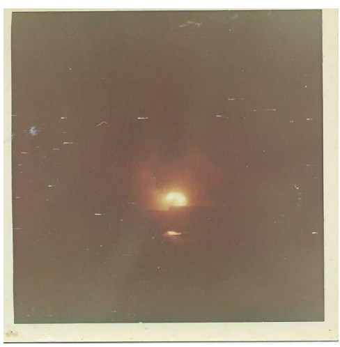
VN Dau Tieng ammo dump Explotion. jpg | Pulling Berm duty one night and some incoming hit the helicoptor ammo dump. (700x700)