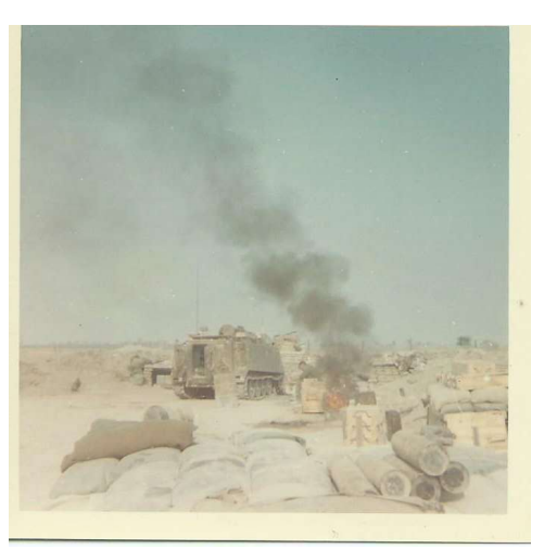
VN Hardspot Sewer Disposal.jpg | Anyone remember having to burn crap? (700x700)