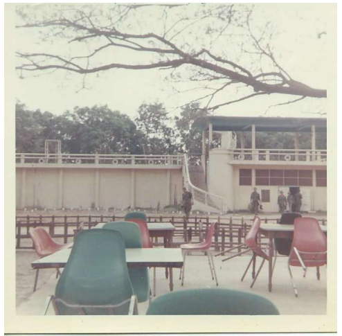
VN Swimming Pool at Dau Tieng.jpg | Dau Tieng Swimming Pool. I remember sneaking in one night when we were in the rear area and some a-Hole stole my billfold. (700x700)